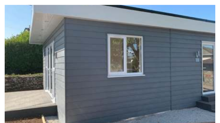
iHus customer's Hickleton annexe

The Hickleton Granny Annexe is the largest of our one-bedroom annexes. All three footprints boast a spacious open-plan living area with a galley style kitchen adjacent.