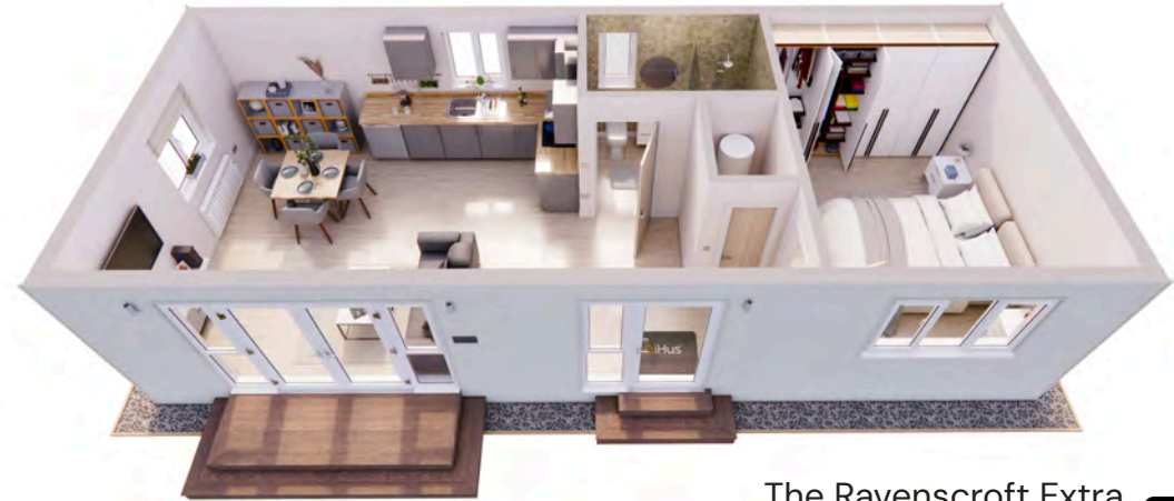
The Ravenscroft Extra

The Ravenscroft is a spacious one-bedroom annexe, designed for those with a larger garden plot. All three footprints utilise a central shower room to separate the bedroom and the open-plan kitchen/ living area to maximise living space.