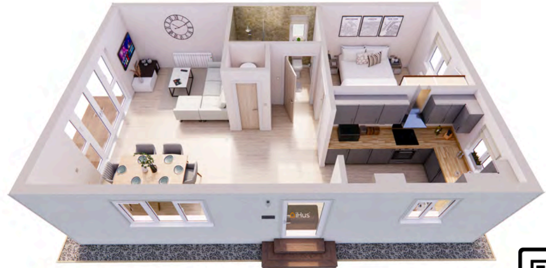
The Hickleton Extra

The Hickleton is the largest of our one-bedroom annexes. All three footprints boast a spacious open-plan living area with a galley style kitchen adjacent.