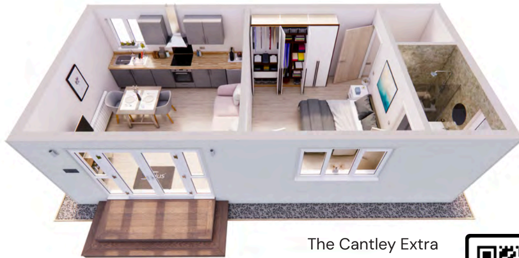
The Cantley Extra

The Cantley floor plan is designed to maximise space and fits comfortably into most back gardens.