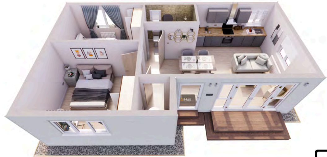
The Hatfield Extra

The Hatfield is a spacious L-shaped annexe with two great-sized bedrooms. All three footprints look stunning and are ideal for large corner plots.