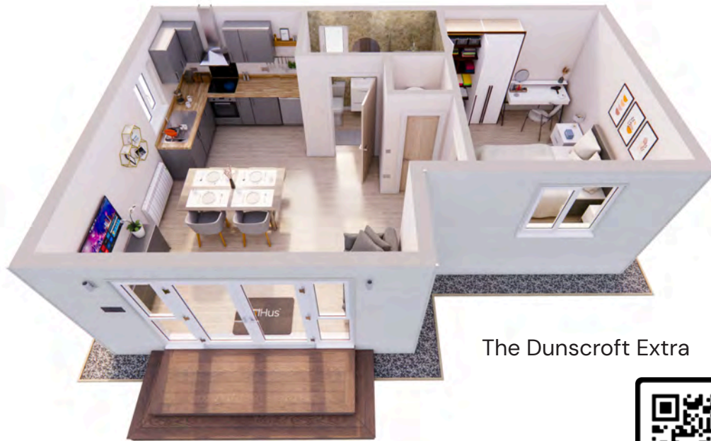
The Dunscroft Extra

The L-shaped Dunscroft is an ideal annexe for small corner plots. Each footprint features a double bedroom, shower room and a large open-plan kitchen/living area.