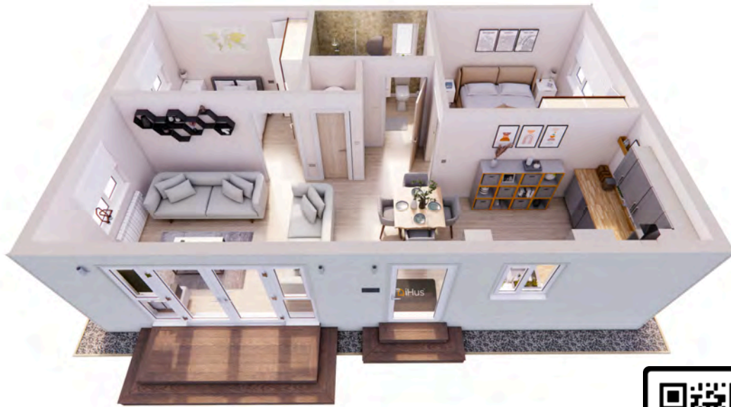
The Loversall Extra

The Loversall provides plenty of living space and two good-sized bedrooms. The 'Extra Plus' is one of the most popular annexes within our Core range.