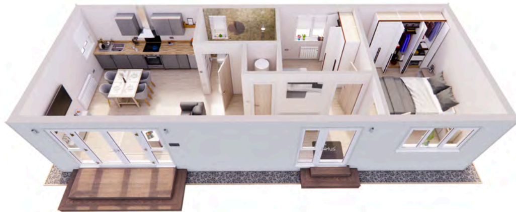
The Melton Extra

The Melton is designed with a master bedroom and a smaller second bedroom that can be used as a home study if preferred. The 'Extra Plus' provides a master bedroom larger than in most new build homes today.