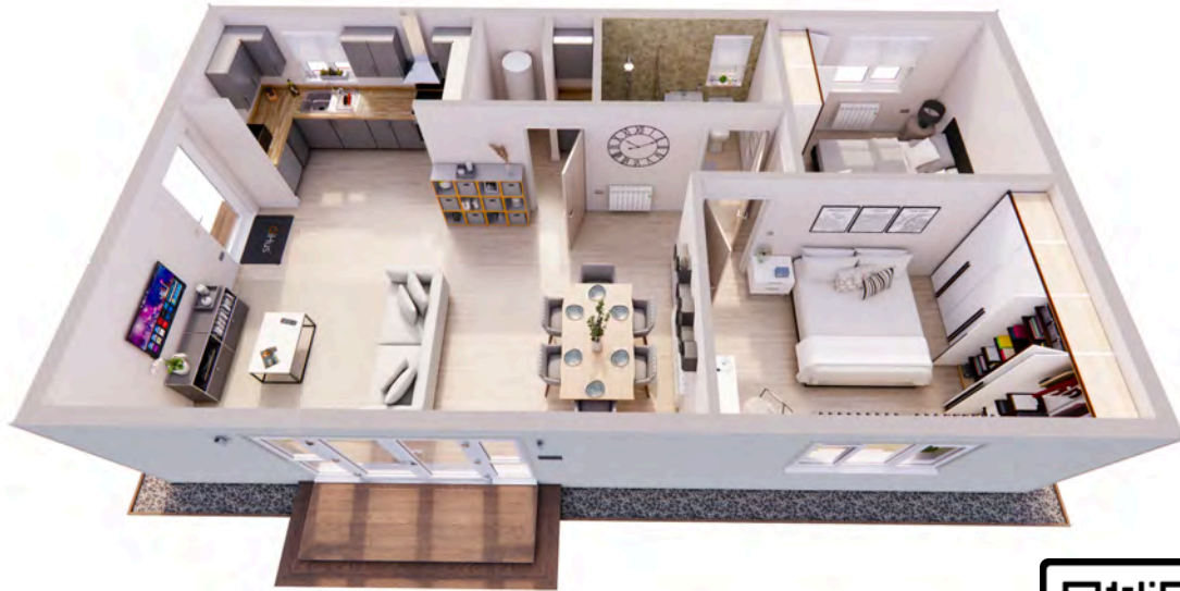
The Wheatley Extra

The Wheatley is our newest, and most popular, two-bedroom annexe. The design provides a large amount of living space, as well as two good-sized bedrooms.